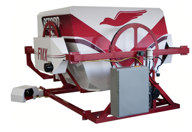
Cecil, OH T-1 Simulator